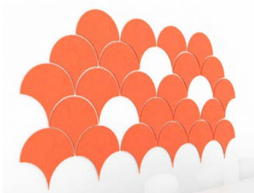
Acoustic panel detail