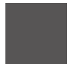
Square 24" x 24"