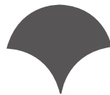
Aspen 24" x 24"