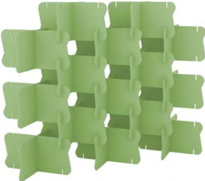
Acoustic panel detail